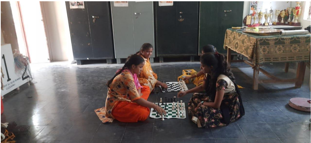
Game of Chess