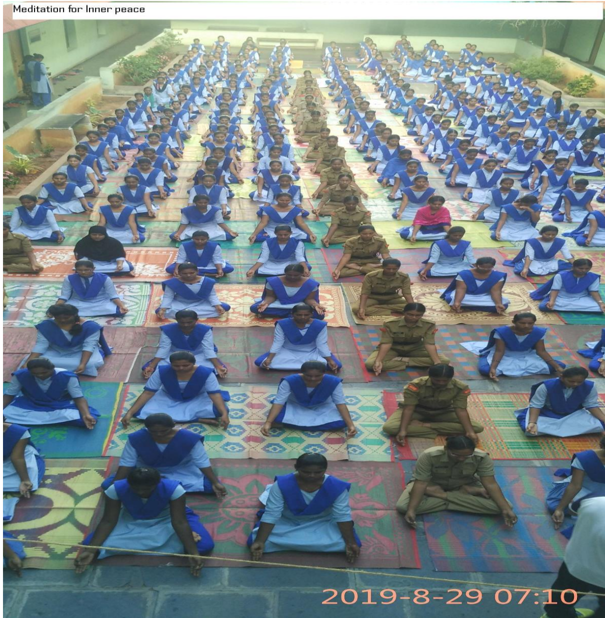
Meditation for Inner peace

6. Self defence – we can face any danger